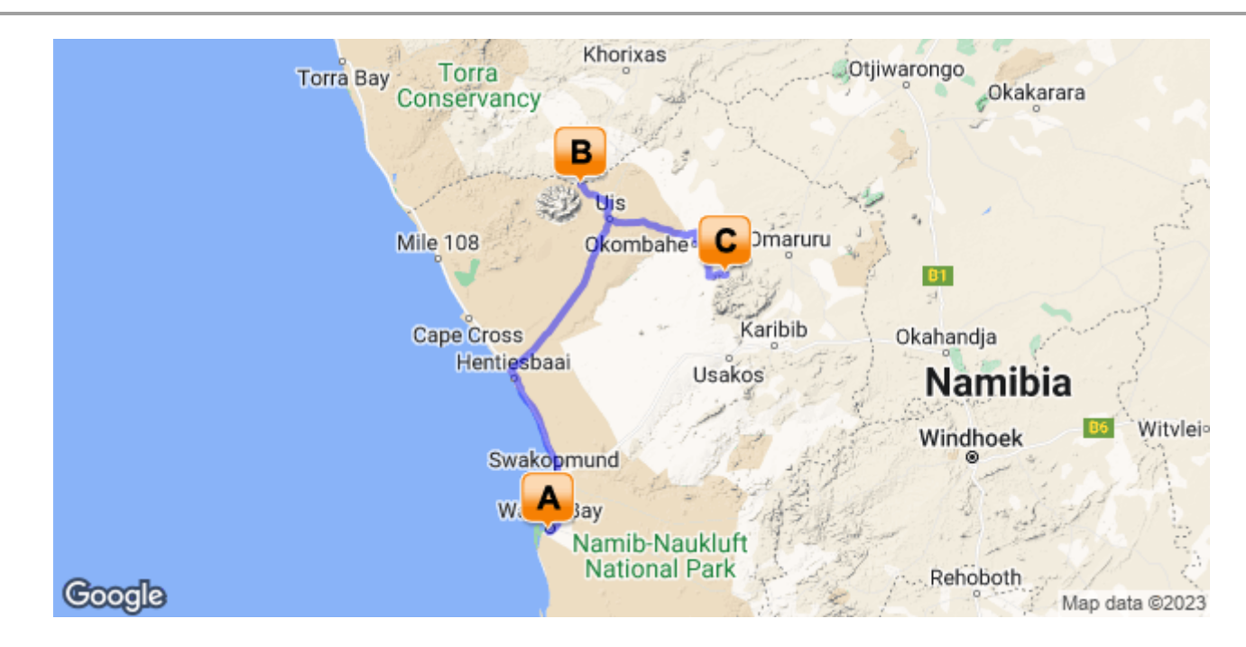
Click here to view your Digital Itinerary