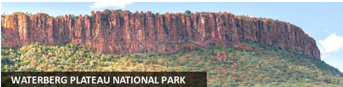
WATERBERG PLATEAU NATIONAL PARK