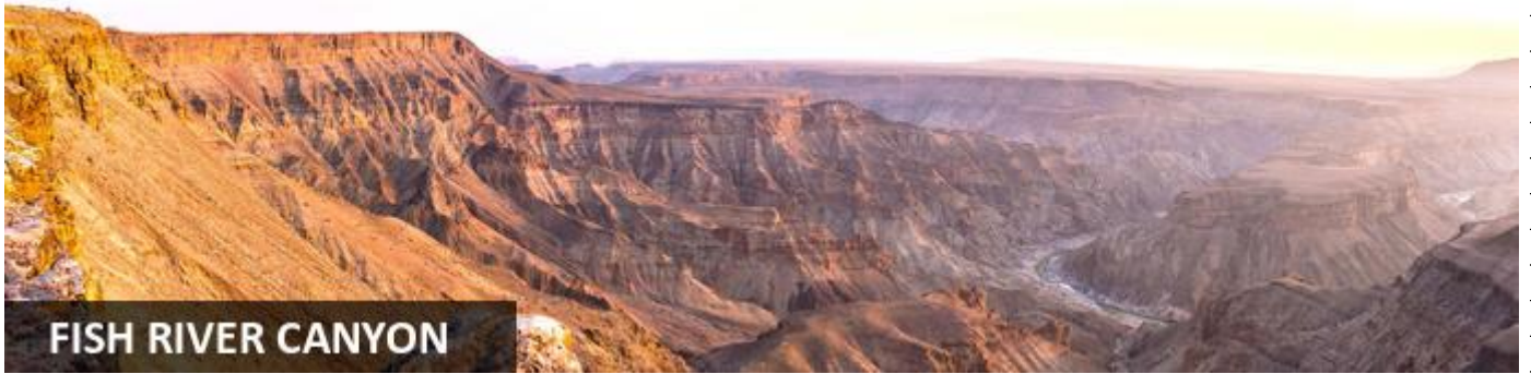
FISH RIVER CANYON