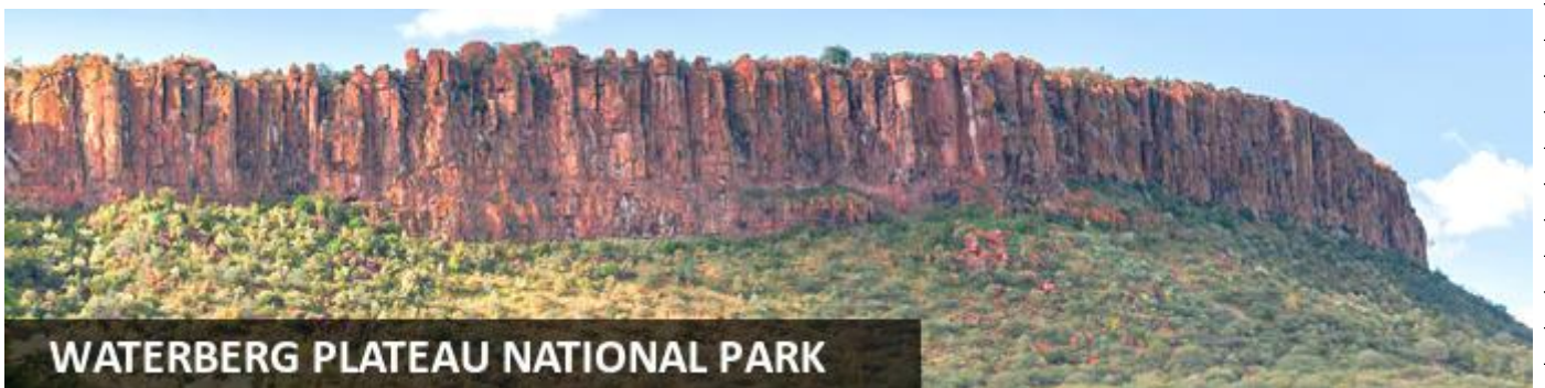
WATERBERG PLATEAU NATIONAL PARK